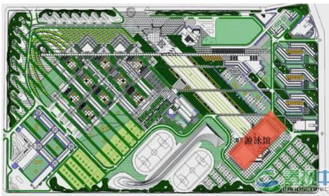
Fig 4: Natatorium of Shenyang Jianzhu University

At present stage, it is advisable to place small-scale natatoriums in school or in community to increase their usage rate, because