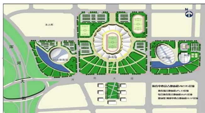
Fig 3: Shenyang Olympic Sports Center

Based on the planning experiences of natatorium home and abroad, the site selection should abide by the following principles so as to create an ecologically friendly environment. First, topography and natural conditions should be taken into account in order to ensure a good lighting and ventilating condition. This will reduce energy consumption in natatorium operation. Secondly, the site should be placed around public parks or green spaces to fully utilize urban public space. This will bring convenience to the citizens, improve the usage rate, and lower the operation costs. Besides, green belt could serve as windbreak, which will improve the microclimate. In summer, it can lower outdoor temperature; in winter, it can prevent wind and dust. Thirdly, proper sound insulation