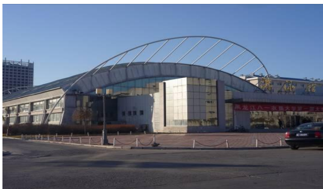
Fig 1: Daqing Bayi Agriculture University Natatorium

In the past, natatoria were usually constructed near stadium and gymnasium to form a large-scale sports center. In the process of urban development, city center becomes increasingly crowded. For this matter, some newly-planned natatoria are