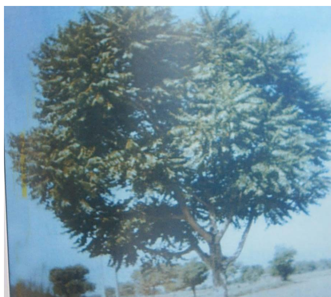
PLATE -1.1 Adhatoda vasica

The plant belongs to the family - Acanthaceae . From vegetational group point of view, the plant belongs to the group of "Tree", it is a medium sized tree, in nature some times it is also observed in the form of shrub. It is tall, much branched (branches are terete) and mostly evergreen tree. The leaves of the plant are lanceolate, large and dark green in colour. From leaf-class classification point of view the plant falls in 'Micro-phylls' class (i.e. 12 to 20 cm. long and 2.5 to 0.5 cm in width). The leaves have some characteristic odour and bitter in taste. Leaves margins are crenate and apex is acuminate with glabrous surface and smooth texture. From life-forms point of view, the plant falls in the group of "micro-phanerophytes". It's flowers are dense and white in colour with purplish markings. It's fruit's are capsular.