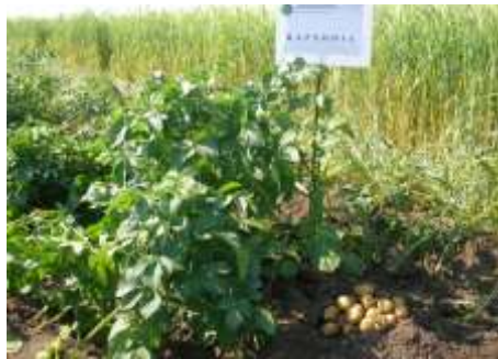
a) Rapsodia Variety

using the fraction of 30-45 mm. In order to destroy of the potato herbage the first treatment was made mechanically, at warning – after 70 days from the plant sprouting. The second treatment was made with Diquat (Reglone forte) 5 l/ha. After three weeks from the vegetation interruption, the harvesting of the tubers was accomplished. The ELISA (Enzyme-Linked-Immuno-Sorbent-Assay) technique was used for the study of diseases produced by the virus of crop plants and also to detect low concentration of viruses in the studied potato cultures. It permits a simple and accurate detection of viruses in stems and in other vegetative organs of plants. Its principle is based on the interaction antigen – antibody. The applied method was DAS–ELISA (double antibody sandwich - ELISA). The tested viruses were: PLRV (potato leafroll virus), PVA (potato virus A), PVM (potato virus M), PVS (potato virus S), PVX (potato virus X), PVY (monoclonal and polyclonal potato virus Y). There were used the following reagents: IgG (immuno-conjugate), conjugate, positive control, negative control, extraction buffer, coating buffer, conjugate buffer, washing buffer, substrate, microplates, substrate (pNPP tablets). Due to the test's high sensibility, viruses could be detected before symptoms manifestation.