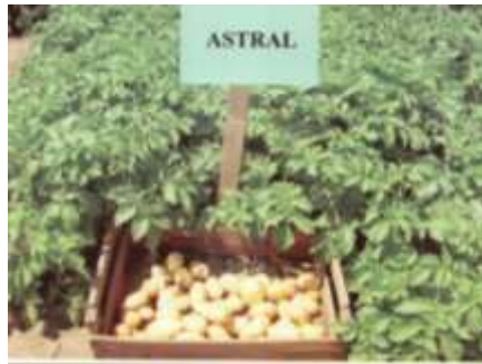
b) Astral Variety