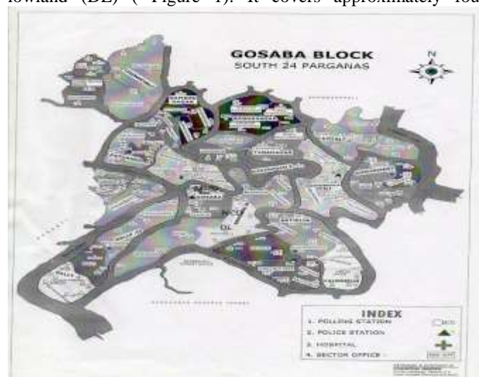
Figure 1: Study area showing sampling sites of Gosaba sq. km area. The season for collections was June- July, 2016 (before rice cultivation). The area is mostly mono-cropped (rice cultivated).

Soil samples were collected for the kharif season from three different depths (0-20, 20-40, 40-60 cm) from three different villages of Gosaba Block (Lat. 22^{\circ} 09' - 22^{\circ} 10' N ; Long. 88^{\circ} 47' - 88^{\circ} 48' E ) of South 24 Parganas district of West Bengal (India) coming under three different landforms namely, non-cultivated deltaic (NCD), mudflat (MUD) and depressed lowland (DL) ( Figure 1). It covers approximately four