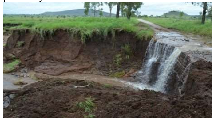
DEVASTATING EFFECT OF PROLONG RAINFALL INTENSITY ON CROP AND SOIL IN MAKURDI, NIGERIA

In line with the fact that lesser variations in rainfall amount is observed during the beginning of the raining seasons, crops should be planted early for rain fed agriculture for higher productivity.